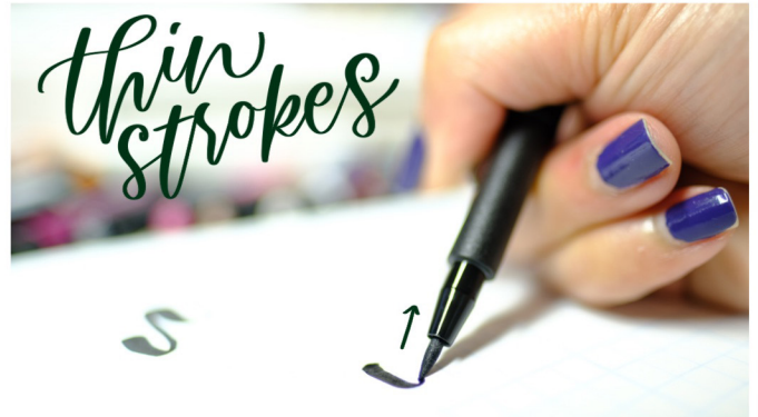
It's best to hold the pen at a 45° angle between the pen and paper.

Thin Strokes or I also often refer to as “upstrokes” are the thin lines that can be achieved by applying very light pressure. Every time you write away your body this is your upstroke motion. Use the tip of your brush pen as you push towards the top of the page while applying very light pressure while you write.