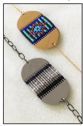
Center Line™ Half Moon Bracelets