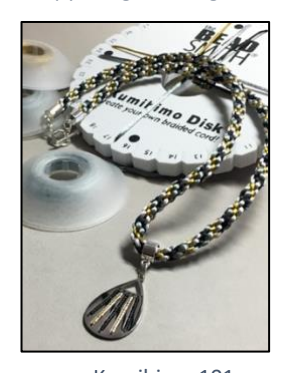
Kumihimo 101 Braiding for Beginners