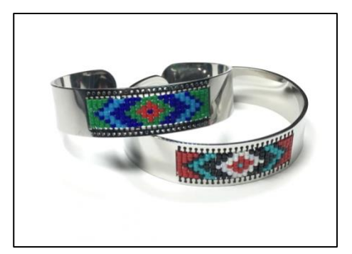
Center Line™ Cuffs