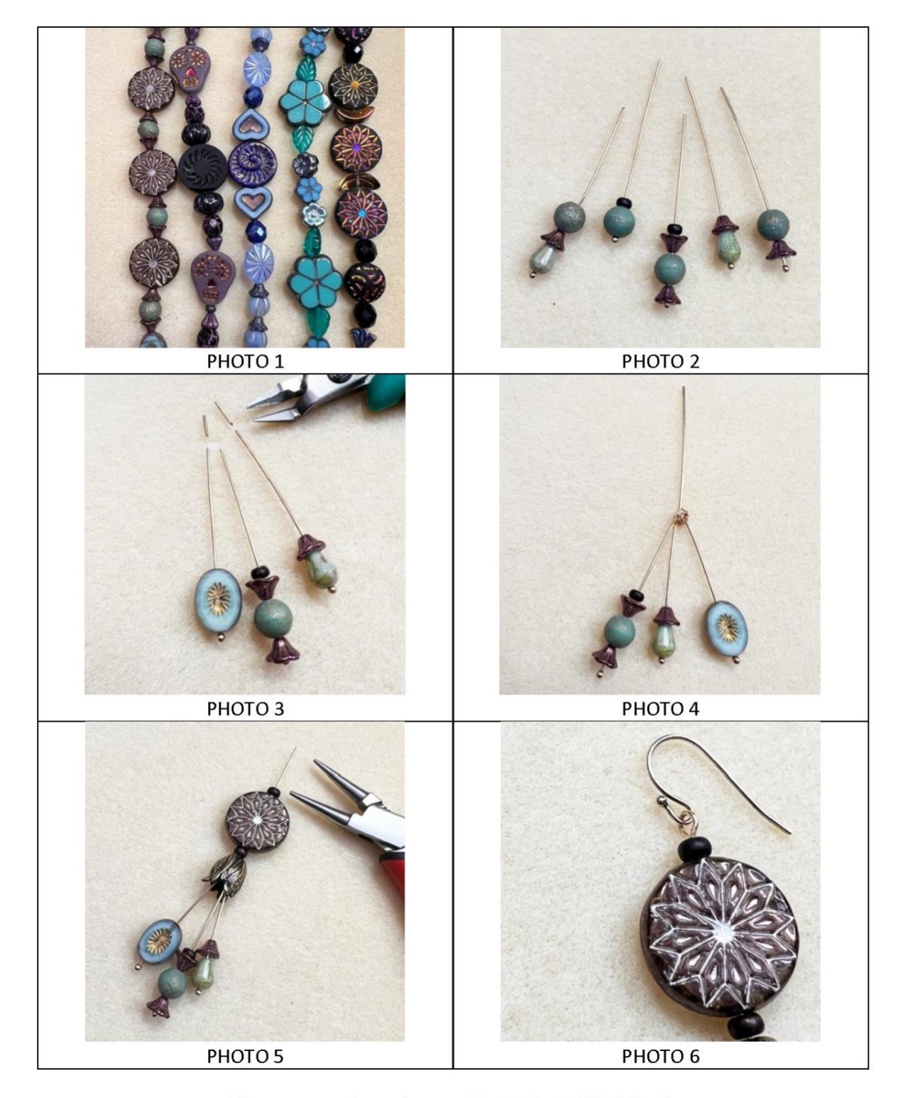
Share your projects photos with #MakeItWithMichaels