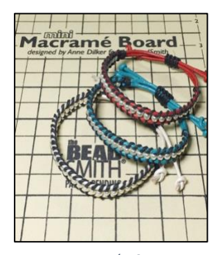
Macramé 101 Stackable Bracelets