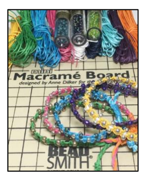
Macramé 201 Two-Tone Bracelets

Share your projects photos with #MakeItWithMichaels