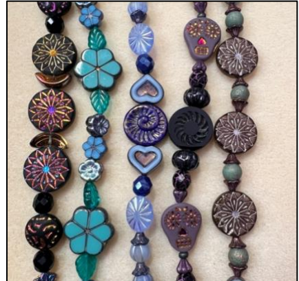
A few table cuts, so many colors and shapes!