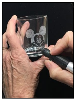
Add personal touches to glass with the Microengraver