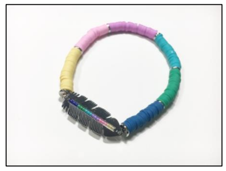
Center Line™ Feather and Heishe Beads Stretch Bracelet