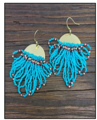
Center Line Half Moon Loopy Fringe Earrings