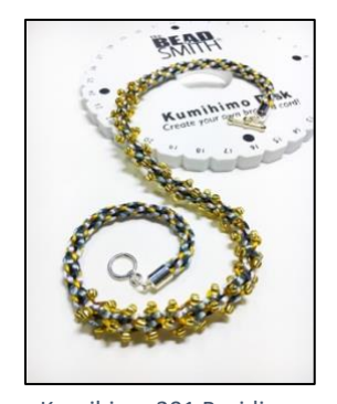
Kumihimo 201 Braiding with Beads for Beginners