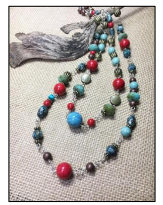
Boho Necklace with the 1-Step Looper